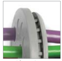
Special fixing ribs ensure a centered fit.