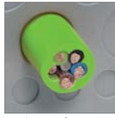
Membrane on front