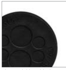
Also available in black.